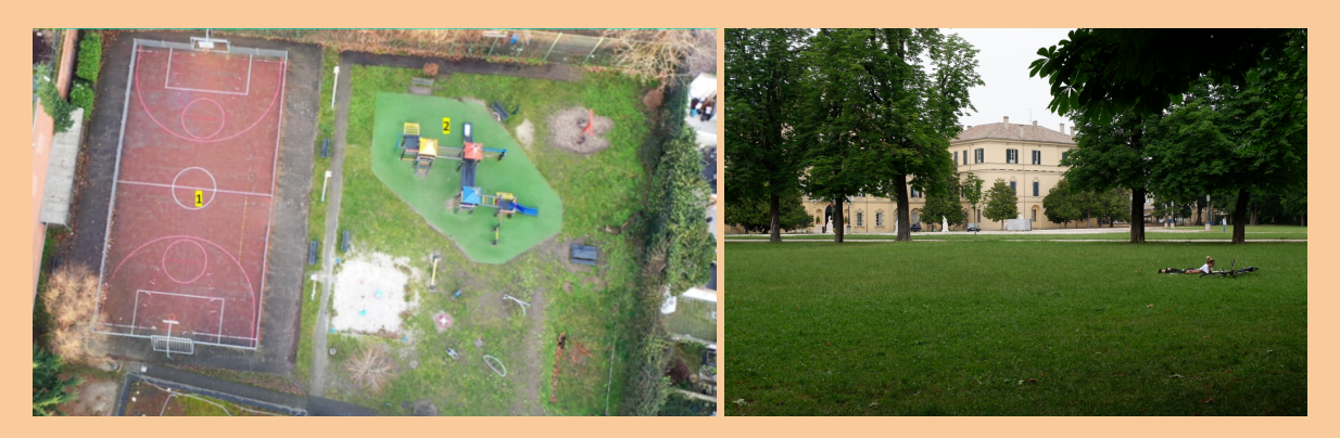
Redesigning city parks. Mechelen Park t' Hofke and Parma Parco Ducale

Works will start soon with the assurance that several contributions were made to create a safe environment in the park for citizens of all ages. Mechelen looked for technological solutions that could increase safety in their city parks. New access control systems and new activities in these parks were tested and developed using the SSA mechanism and a full implementation plan was transcribed into the IAP.