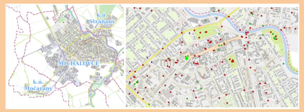
Michalovce's opinion map; red vs. green dots standing for safe vs. unsafe areas

To achieve this the city developed a software tool called "Opinion map"<sup>4</sup> which worked as a social survey of residents that not only could express their complaints, and propose as well what in their opinion could be the possible solutions.