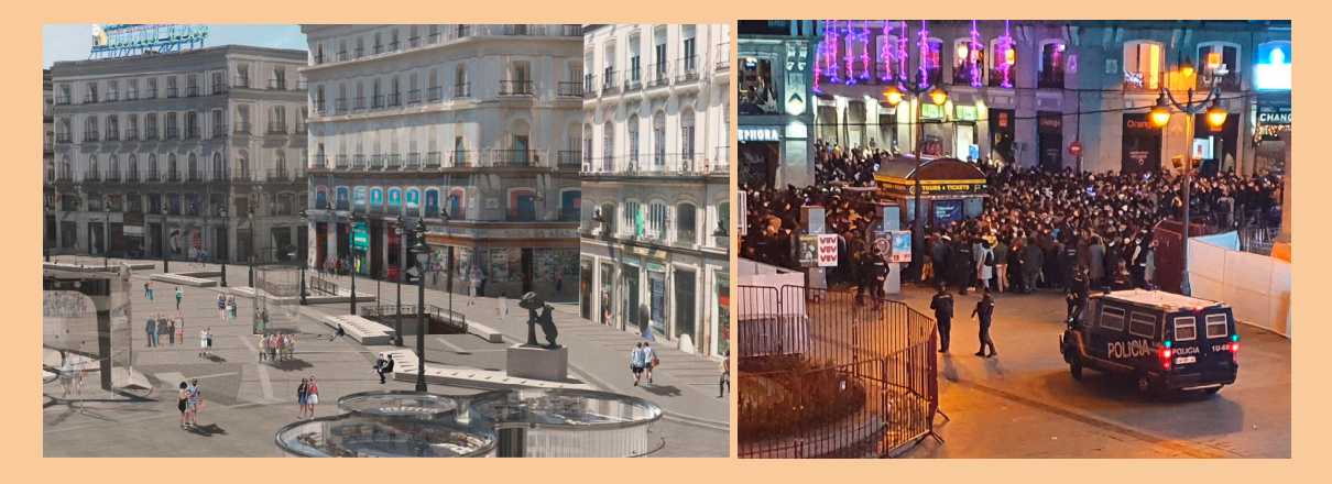
Madrid, Puerta del Sol - security by design removing physical barriers

On the other side of the spectrum, Madrid focused in the area of Puerta del Sol, one of the main squares of the city, crossed by thousands everyday.