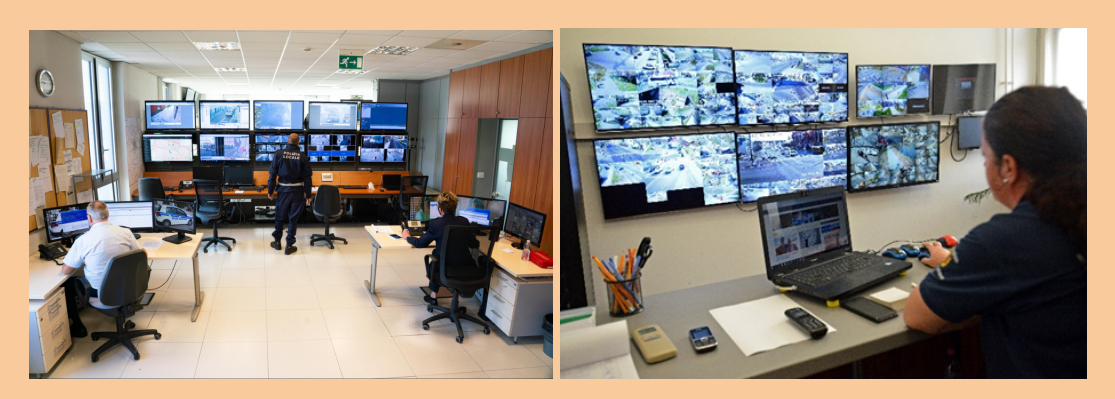
Parma and Mátészalka's CCTV control rooms