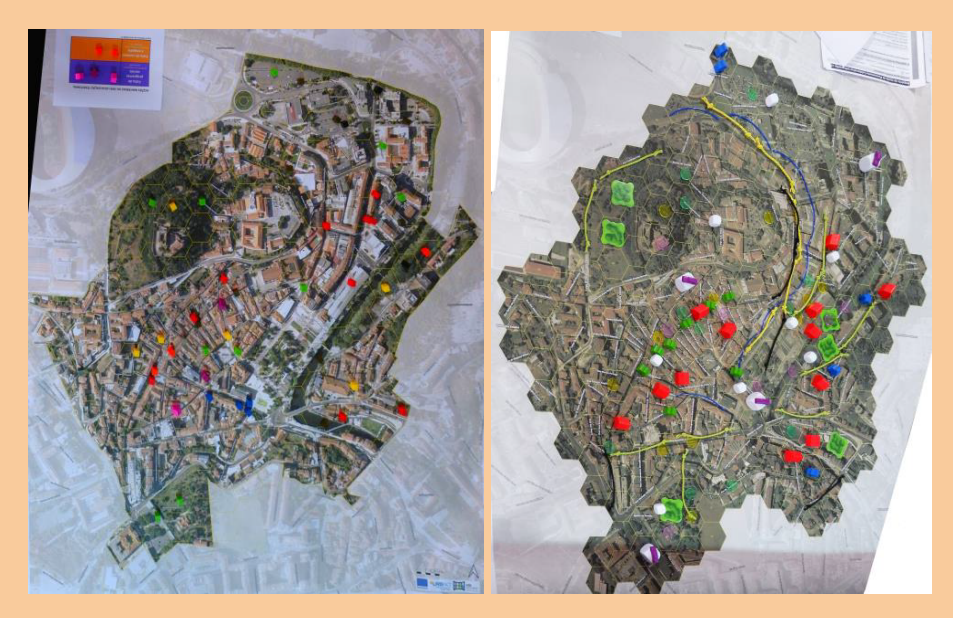
Leiria - focus area with identified problems and proposed solutions

Each participant has a certain amount to invest and puts their choices over a physical map of an area of the city to prioritise intervention spots and define the possible actions to tackle the problem. This process was completely new to the city and proved to bring good results and a practice that was praised by the mayor as a good practice to be used in future projects of the city.<sup>3</sup>