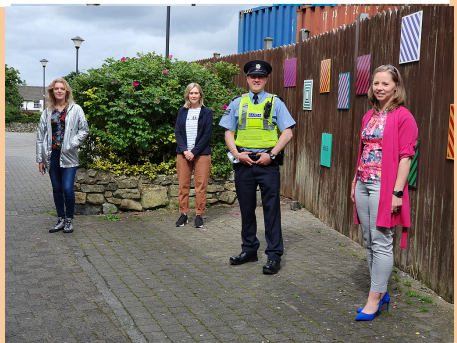
Anti-social behaviour crackdown in Longford walkways underway

The goal is to change people's perception of overall safety in the city. In fact, mainstream and social media coverage tends to focus on high profile, negative news stories, incidents and events. To counter this negative perception, a set of activities were foreseen in their IAP to build community spirit and outline positive interventions and events in the city that can help to make a safer urban environment.