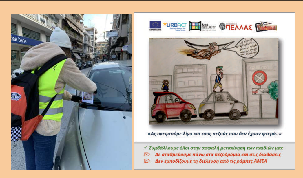
Giannitsa (Pella) street campaign and schools participation

A pilot was implemented through the SSA, proving the action to be quite effective, particularly because the message was sent in a positive way, and not as a matter of law.